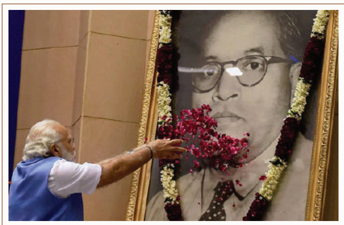
Shri Narendra Modi, Hon'ble Prime Minister of India, pays tribute to Dr. B. R. Ambedkar.