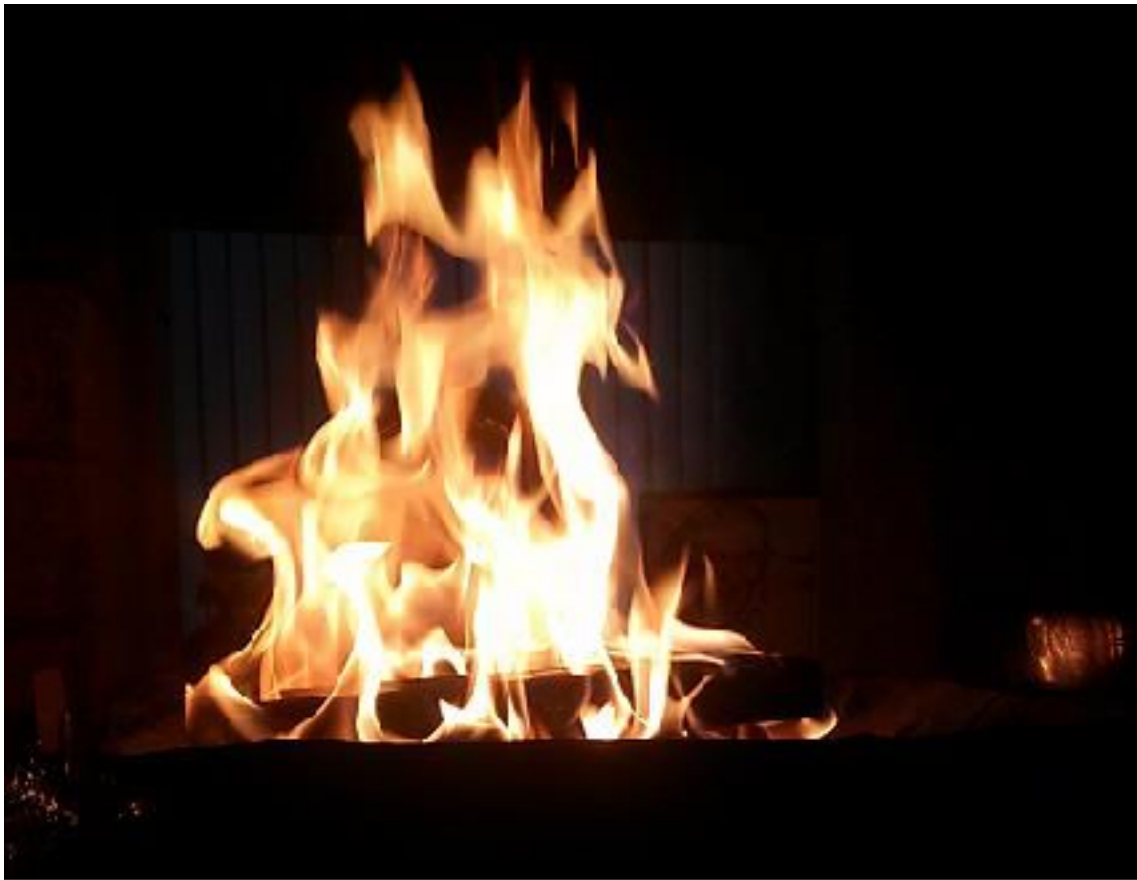
Daily homa , Boston USA, 2013