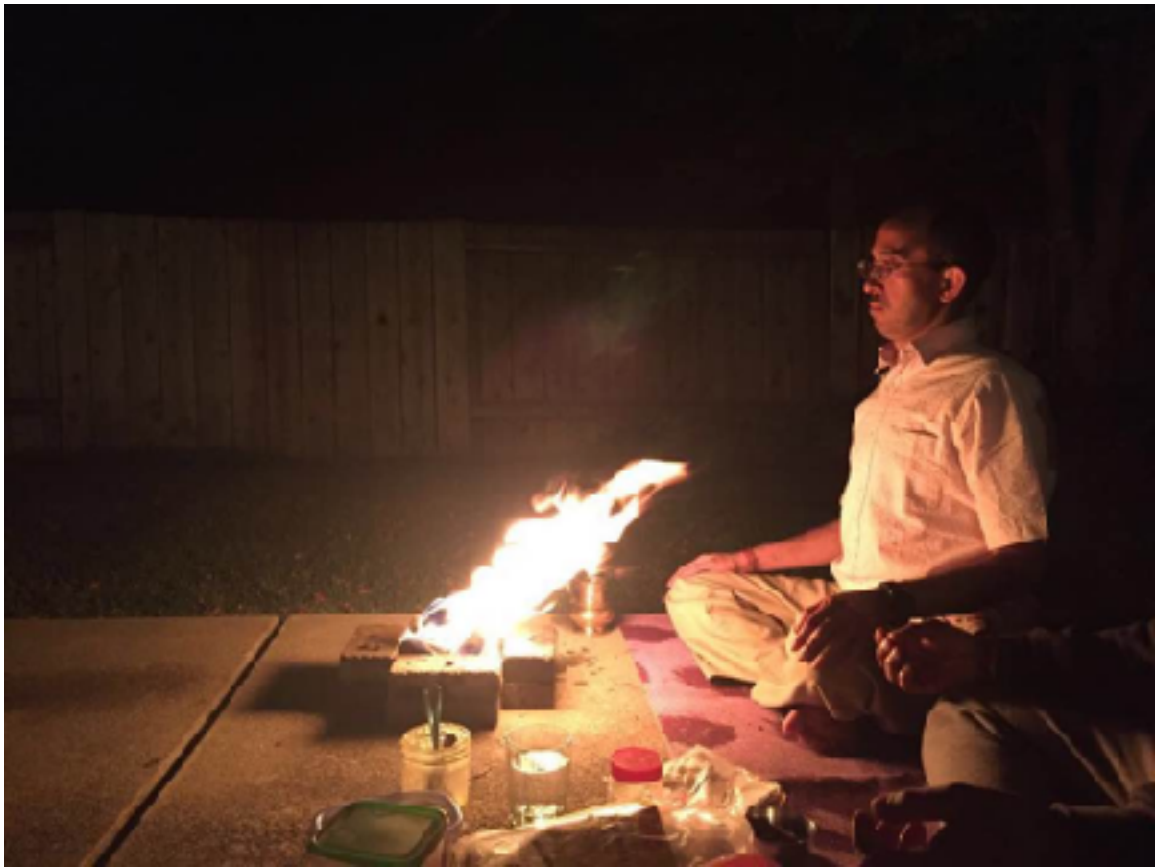
San Jose , 2016