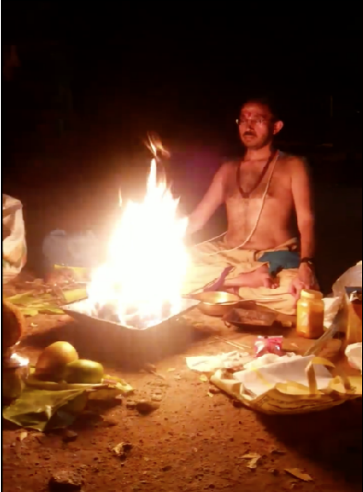
Arunachala , 2016