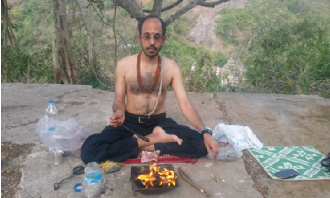
Simhachalam , 2014